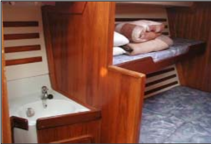
Cabin and WC