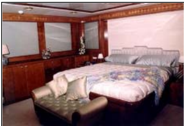
Master quarters bedroom