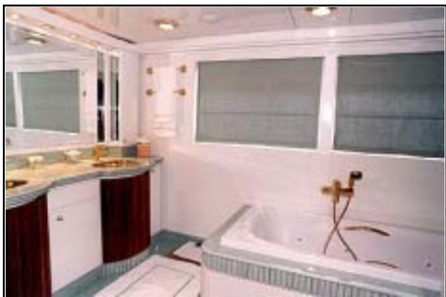
Master quarters bathroom