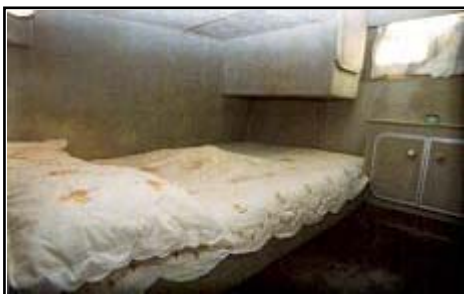
The small bedroom