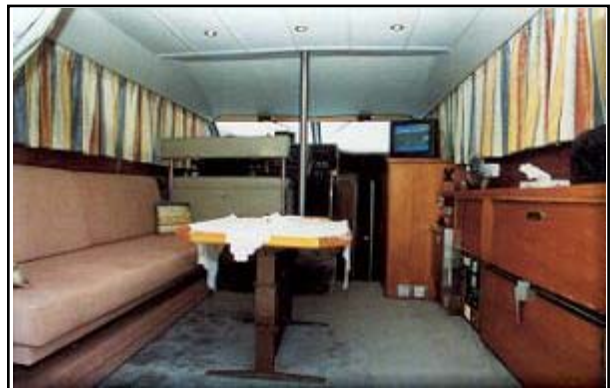
The main salon