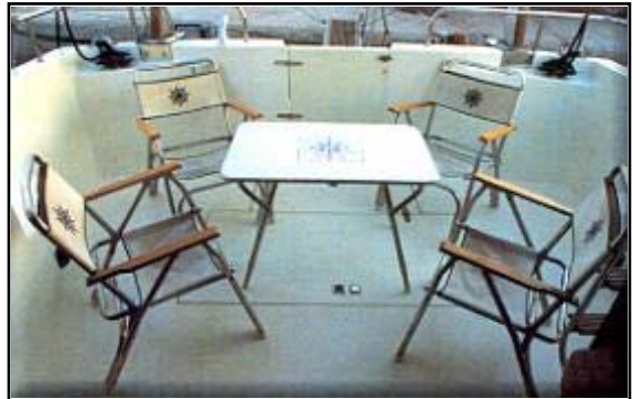
The back balcony