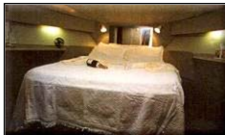
The big bedroom